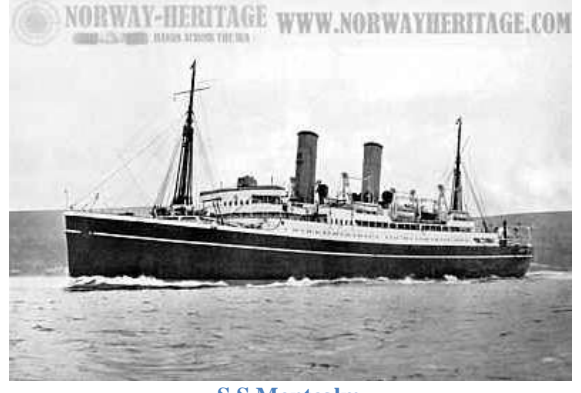
S S Montcalm

on Vancouver Island, British Colombia. They built an enormous house with flag-staff – everyone else lived in shacks! They had a lady help and a Chinaman to work in the garden. The War hit them financially and both those helpers left.