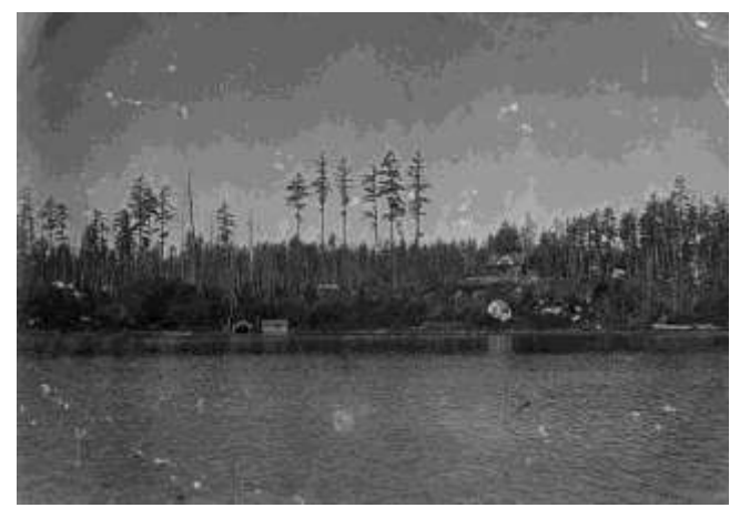
Lake, pump house(?) to left and house to right

Ireland, and was in the midst of pine forests overlooking the lake, high on a hill. The system for the water supply was that my Uncle Irton went to the pump house beside the lake to start up the oil engine to pump the water up to the house. Aunt Florrie meanwhile stayed at the house and watched the weight on a string