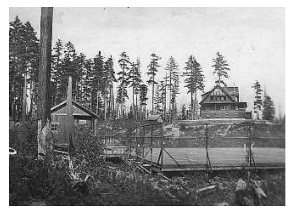
Tennis Court and house at Knockdrin, Vancouver Island

garden. Uncle Irton charged up the avenue at about 50 mph and couldn't stop and drove over the beds of daffodils, decapitating all the flowers and everything in sight, went round and round and finally ended up having rammed a young maple tree, grazing all the bark off and smashing the headlamps, our horrified hostess was standing on her veranda and watched